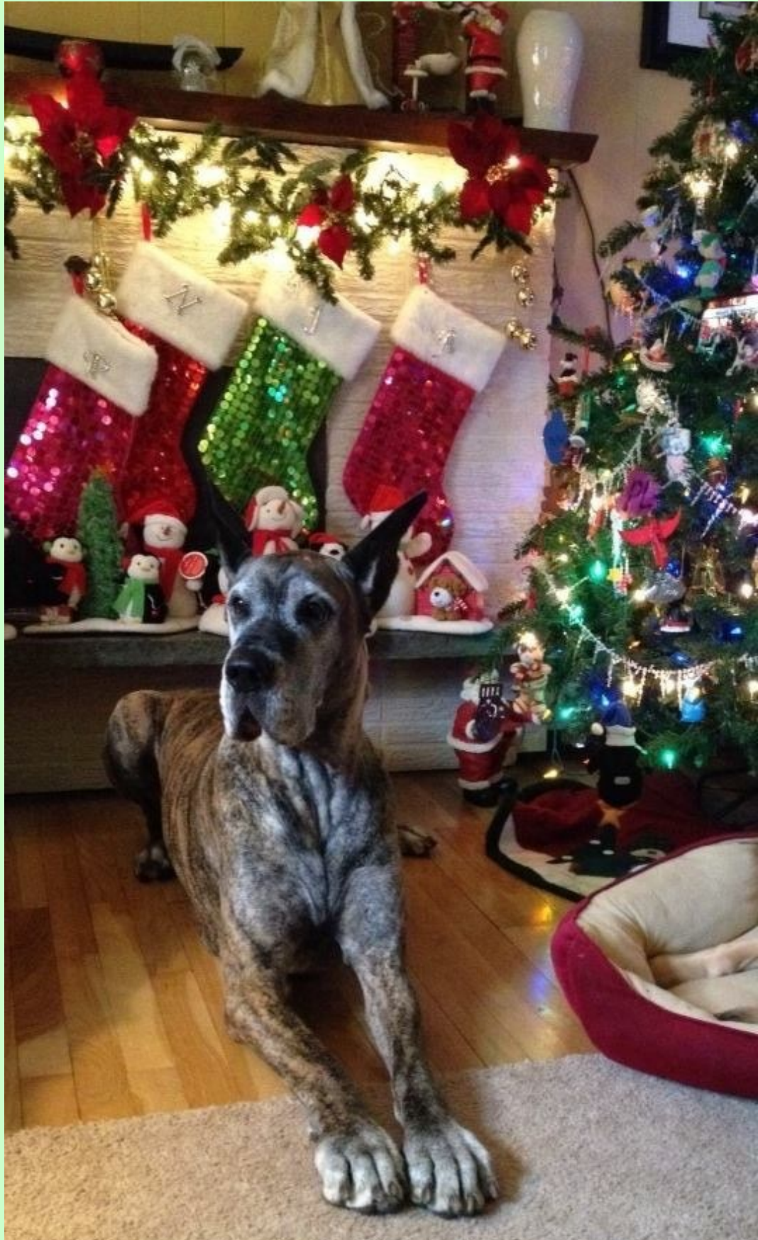
Submitted by Maitau Great Danes