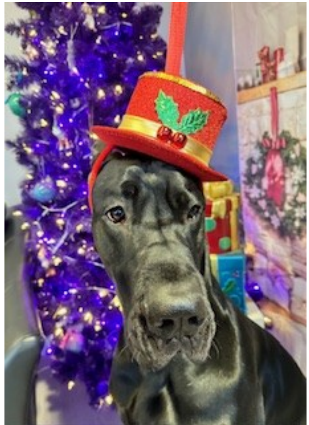
All photos are of Bowman's Unforgettable Sentimental Reason