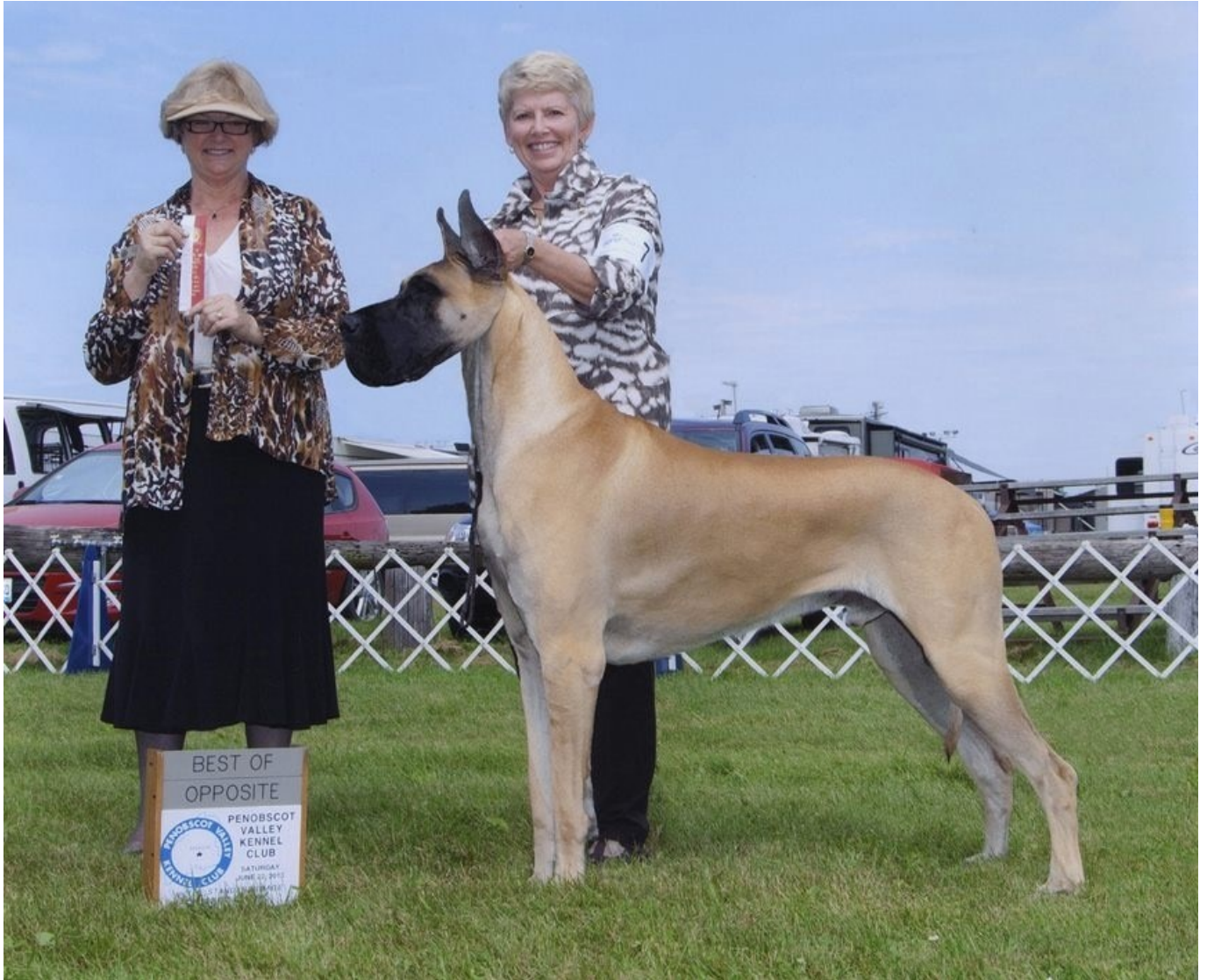
BISS Ch. Maitau N Cosmic Better By Design