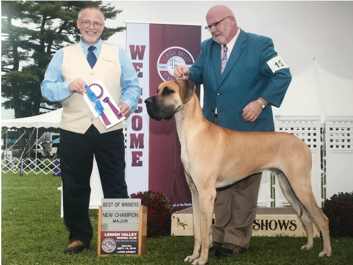
PICKLES (ABOVE) SEVEN (BELOW)